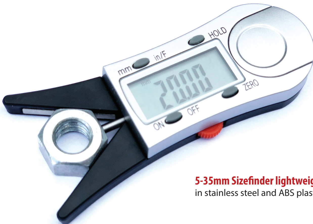
5-35mm Sizefinder lightweight in stainless steel and ABS plastic